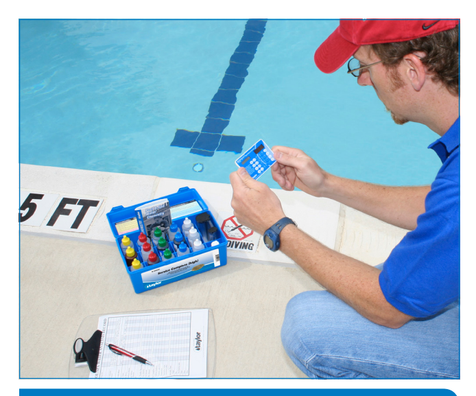
Manage pool chemistry with the aid of Taylor's Watergram Water Balance Calculator, available in a circular or electronic version.

All but the mathletes among us find the Saturation Index calculation daunting. To simplify the process, many years ago Taylor developed a circular kind of slide rule to do the number crunching. We called it the Watergram<sup>®</sup> Water Balance Calculator. Originally, it was composed of two interlocking disks. In 2008 we improved the functionality of the circular Watergram by adding a third disk, and we also introduced an electonic version.