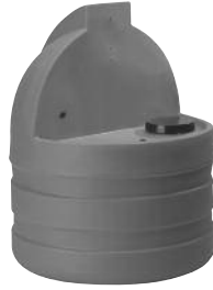
15-Gallon (56.8 Liters)