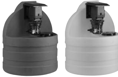
15-Gallon (56.8 Liters)