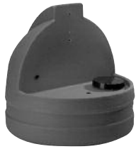
7.5-Gallon (28.4 Liters)