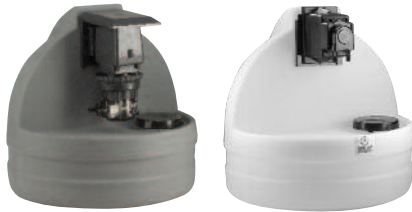
7.5-Gallon (28.4 Liters)