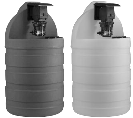
30-Gallon (113.6 Liters)