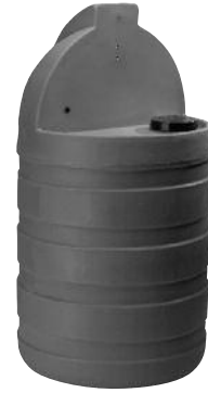
30-Gallon (113.6 Liters)