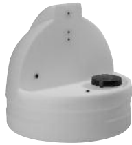
7.5-Gallon (28.4 Liters)