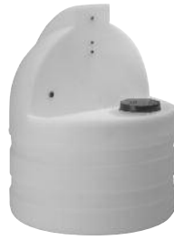
15-Gallon (56.8 Liters)