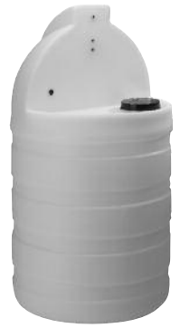
30-Gallon (113.6 Liters)