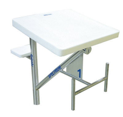
GRIZZLY 21655 REAR STEP 21654 SIDE STEP