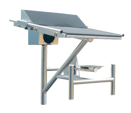
FUSION 57281 FUSION BY SPECTRUM 57572 FUSION TOP