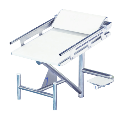
XCELLERATOR 57282 SINGLE POST