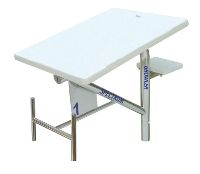
GROWLER 21657 REAR STEP 21653 SIDE STEP