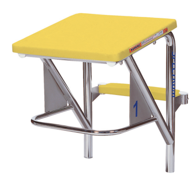
BIGHORN 21115 LONG REACH 21095 STANDARD REACH