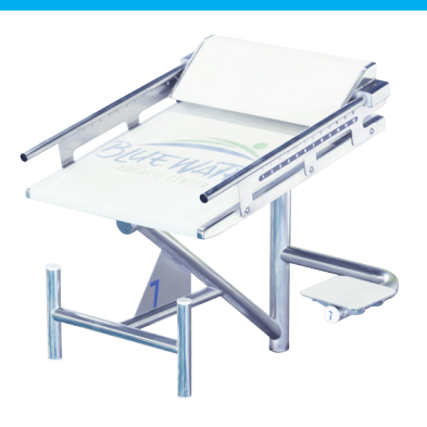
Xcellerator, Record Breaker and Fusion available with custom logo upgrades.