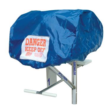
STARTING PLATFORM COVER 21400 SOFT STARTING PLATFORM COVER