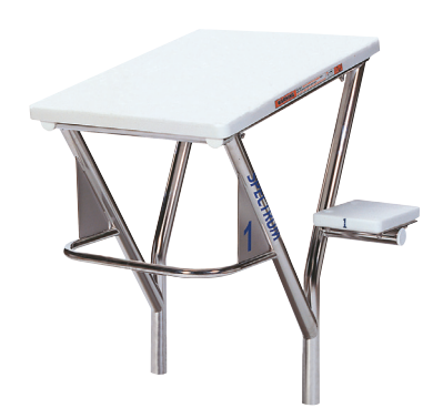
COUGAR 21135 SIDE STEP 21145 REAR STEP