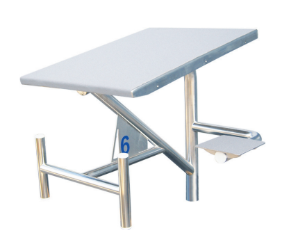
RECORD BREAKER 57283 SINGLE POST 57741 DUAL POST