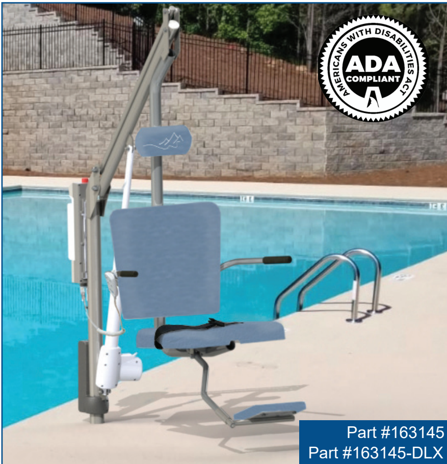
Part #163145 Part #163145-DLX

The Motion Trek 400 and 400 Deluxe are ADA compliant battery powered lifts that are self operable from the deck and water with a robust operating system. These lifts are designed for in-ground pools and spas.