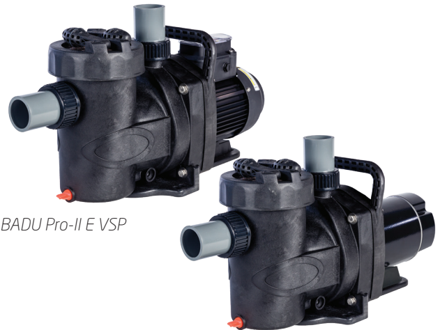
BADU Pro-II E VSP