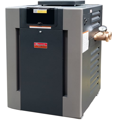
Digital model with outdoor top shown