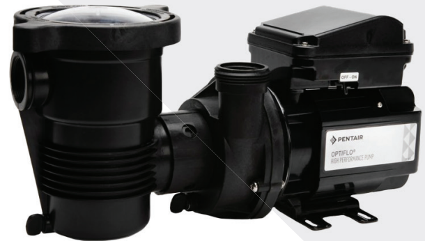
OptiFlo Aboveground Pool Pump

Note: The 3/4 HP OptiFlo, 1.5 HP OptiFlo and all Dynamo pumps represented here are non-compliant products included strictly for comparison. The new 1.0 THP OptiFlo represents the only series of pumps available for order.