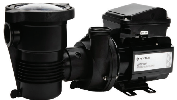
OptiFlo Aboveground Pool Pump

Oh, and it's a summer breeze to maintain. All in all, a water-wise way for aboveground pool owners to remain carefree, and confident well after the regulations take effect.