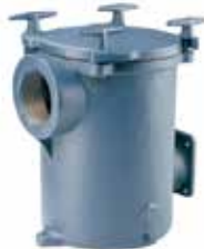
Pkg. 98/99 (8")