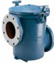
Pkg. 184/184C (9 1/2")