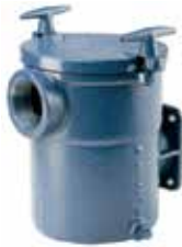
Pkg. 51/56 (6")