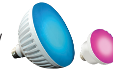
ColorSpash LXG-W Pool/Spa Lamp