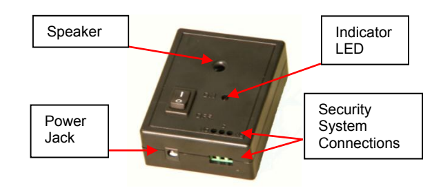
Figure 4 Receiver

Your remote receiver works with the Door/Gate alarm allowing you to monitor your door or gate from within your house. When the gate alarm is activated it sends a signal to activate the receiver.