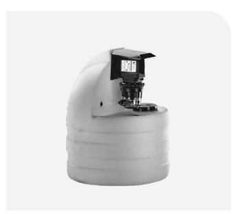
pH/C| CHEMICAL FEED SYSTEMS