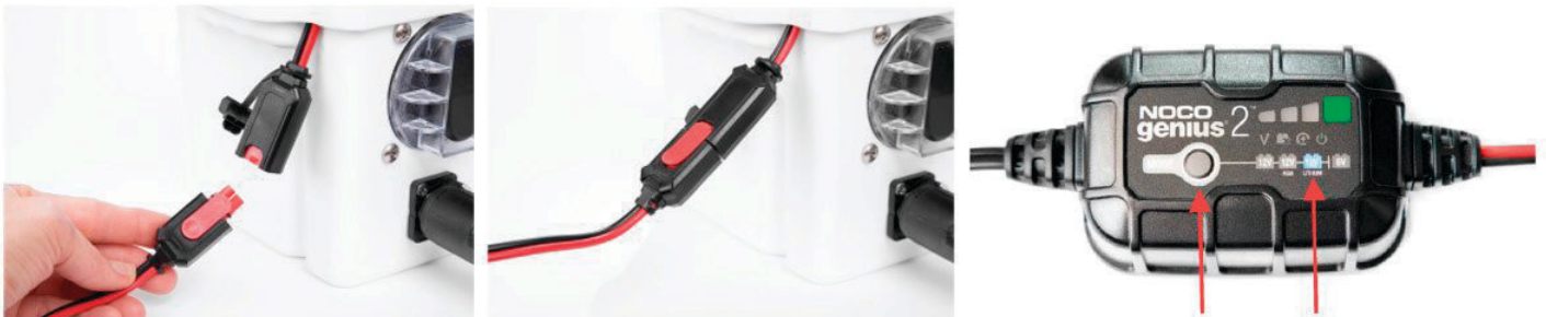
Use the MODE button to set the charger to LITHIUM

Your REMORA™ pool cleaner is equipped with a 12 volt Power-Sonic® LiFeP04 Lithium ION Bluetooth battery. The battery is thermally protected and completely sealed. No maintenance other than charging is required.