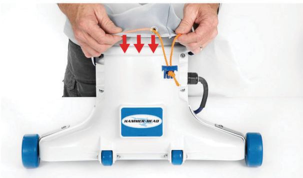
USING THE HAMMER-HEAD DEBRIS BAG

1. Pull the debris bag down over the lip on the vacuum head. Placing the clip over the front decal and standing over the vacuum head will allow you to tighten the clip.