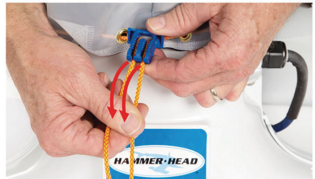
USING THE HAMMER-HEAD DEBRIS BAG

2. Pull both strings so that the clip is as tight against the vacuum head as possible, then pull the strings down tightly into the grooves of the clip.