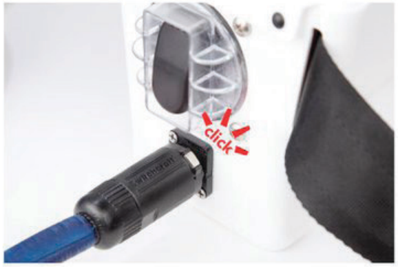
STEP 3 - PLUGGING IN THE HAMMER-HEAD® REMORA™

Your REMORA™ power cord must be aligned properly to fit into the battery box receptacle. The arrow on the silver release tab should align with the top right corner of the receptacle flange as shown below. Push the cord plug in until it clicks. To release the plug, press down on the silver arrow. Do not twist the plug end when inserting it into the receptacle.