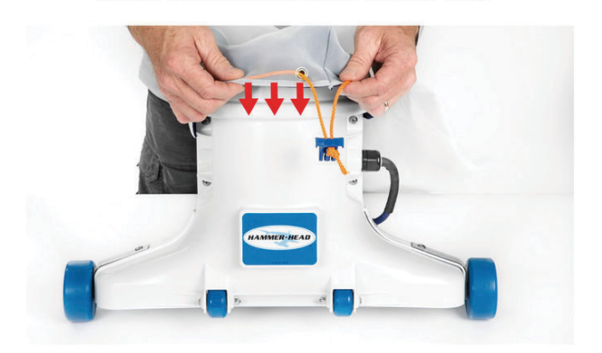
Pull the debris bag down over the lip on the vacuum head. Placing the clip over the front decal and standing over the vacuum head will allow you to tighten the clip.