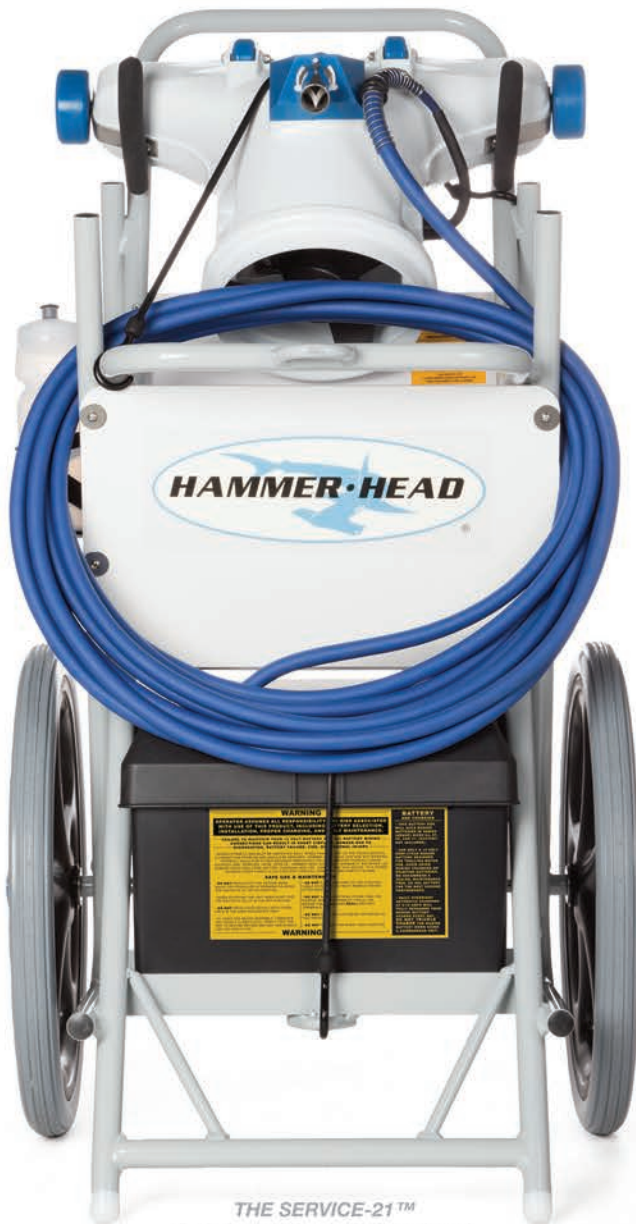
THE SERVICE-21™ (includes vehicle mount—not shown)