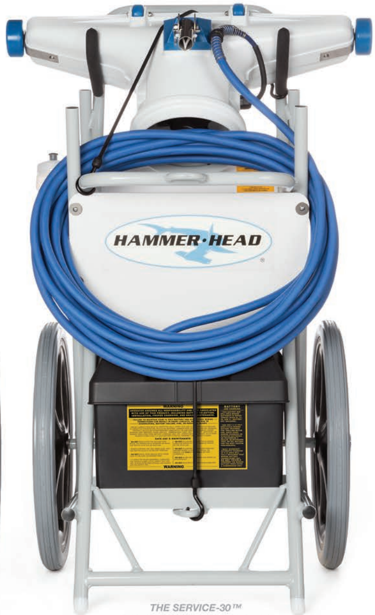
THE SERVICE-30™ (includes vehicle mount—not shown)