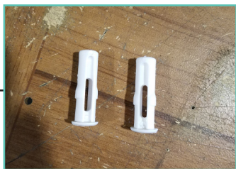
Pin USSP0096 & USSP0097