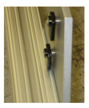
60" or 74" upright