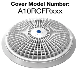
FIGURE 1 – SOFA MODEL & FLOW PATH

DIRECTIONS: Please follow the SOFA specific flow rates, sump specifications, and flow path zone information below. The installation must conform to these minimum/maximum requirements including the SOFA dimension defined in Figure 1. The flow path zone is defined by dimensions A through E. The installed sump may be manufactured or field-built and it may be larger/deeper than Figure 1. Please write the Cover Model Number, orientation, and SOFA Model Flow Rating on the VGBA DRAIN COVER IDENTIFICATION INFORMATION label that comes with each AquaStar Pool Products, Inc. drain cover.