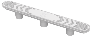
FIGURE 1 – SOFA MODEL & FLOW PATH