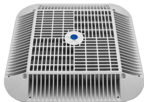
FIGURE 1 – SOFA MODEL & FLOW PATH